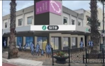
(suggested placement)